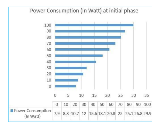
Figure 1. Power Consumption at initial phase.

Likewise, power consumption of ten (level) of intensities were measured at the initial phase and after one hour. The total power of the whole system at the intensity of 60 was found to be approximately 20 watts. After an hour, the power consumption increased only slightly after 70 intensities (Figure 1 and 2).