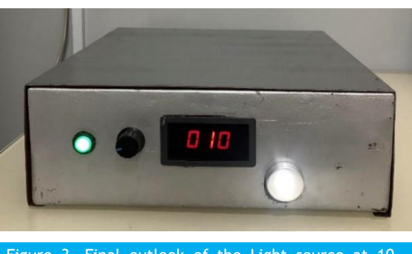
Figure 3. Final outlook of the Light source at 10 intensity.