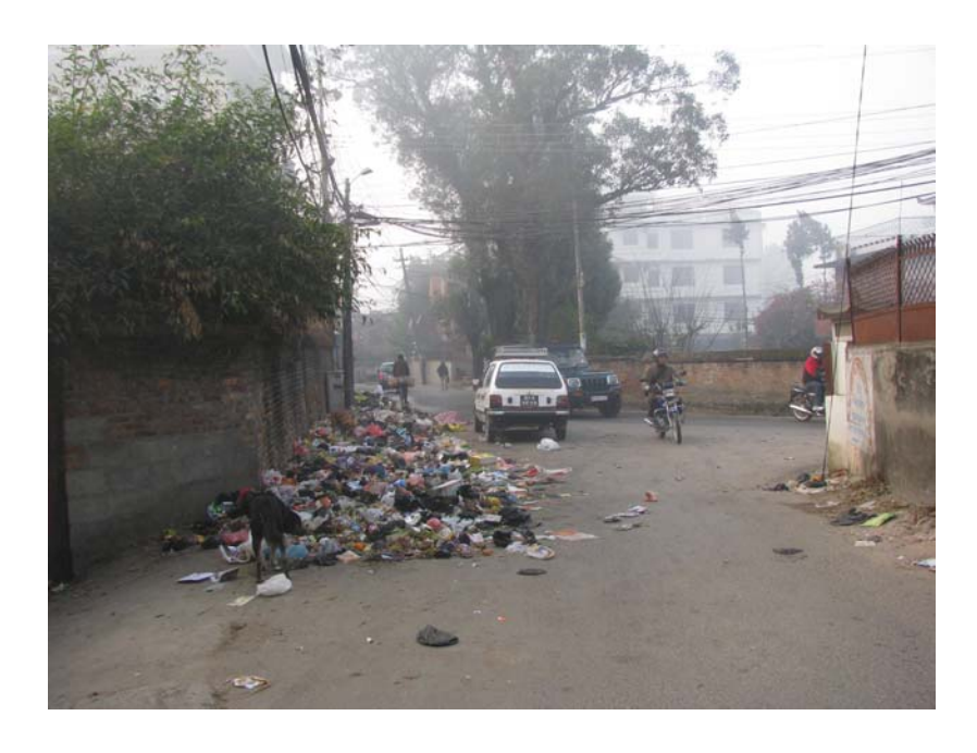
Waste Collection on the road side