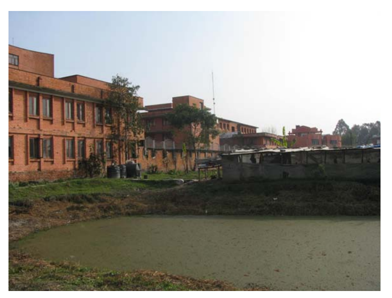
Water logged area near by Residential and Office complexes