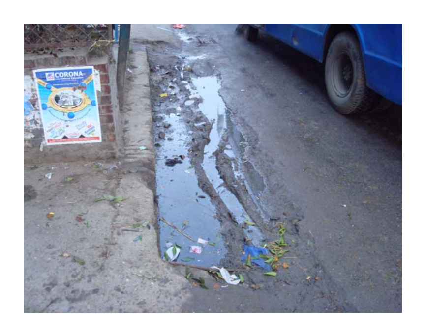
Unpaved and undulated surface with waste water littered