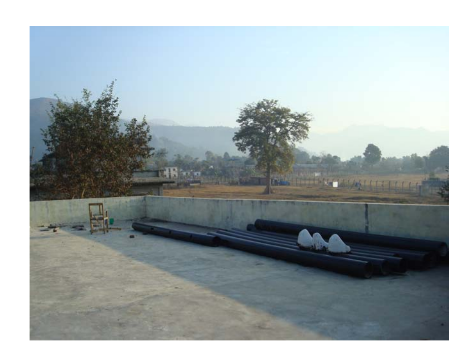
Storage of building materials on the roofs may retain water