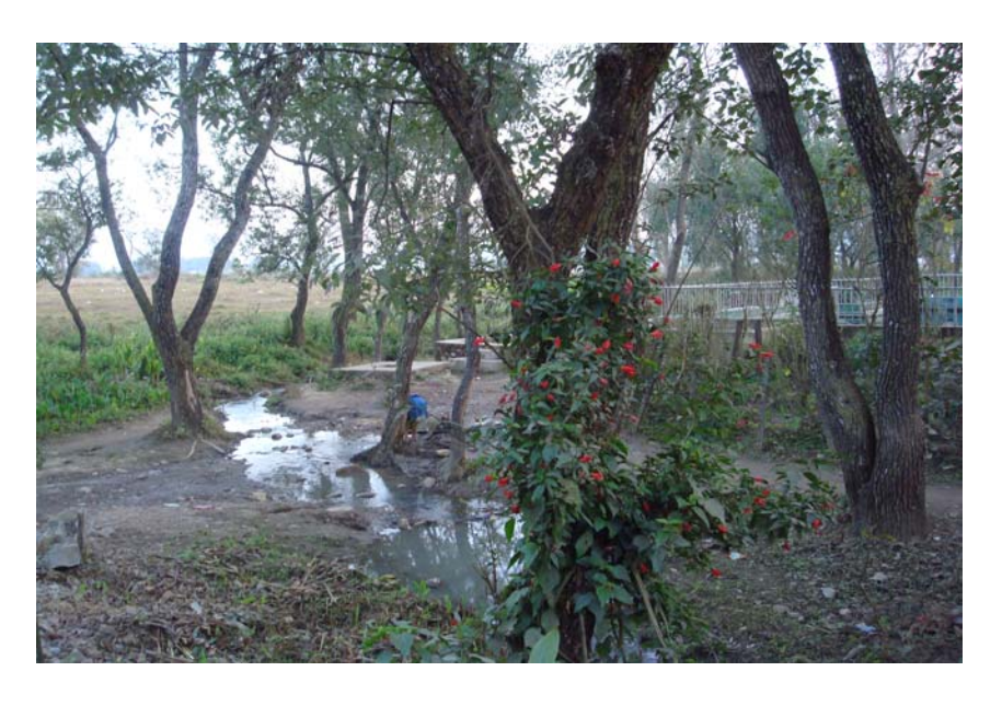
Poorly constructed and inadequate drainage systems hindrance storm water making them waterlogged