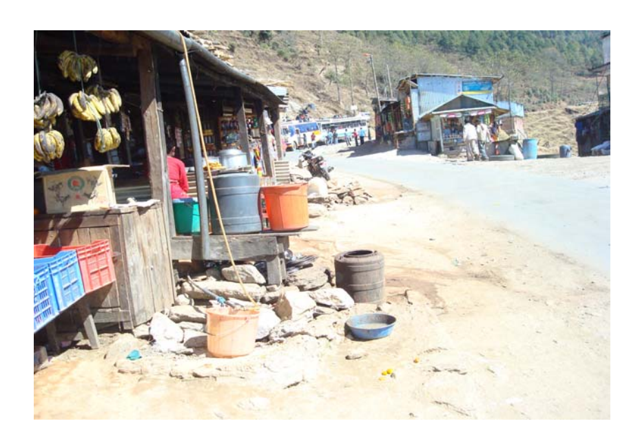
Water Container without Lid