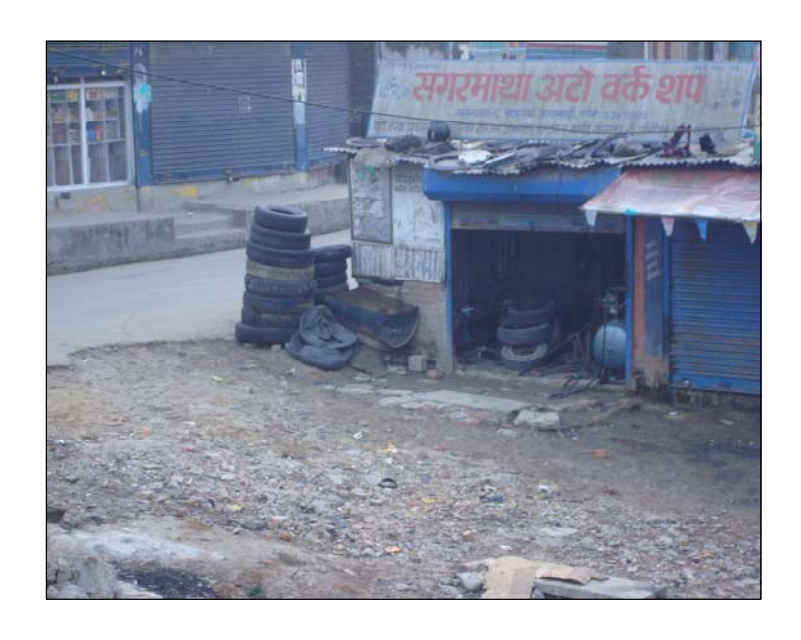
Old and unused tyres usually stacked on the road side