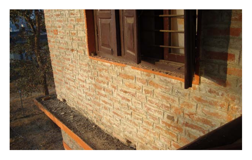
Unfinished Chajja may retain water