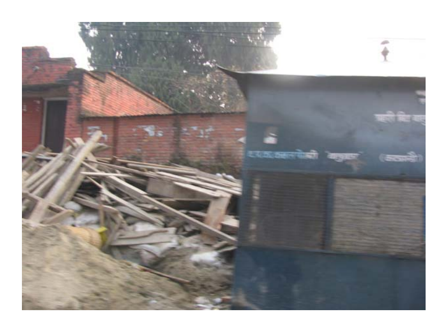
Unclear of Construction Formwork after Building Construction