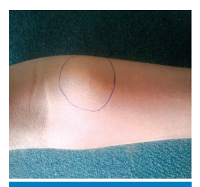
Figure 1. Swelling in the right forearm.

giant cells. There was no evidence of cysticercosis.