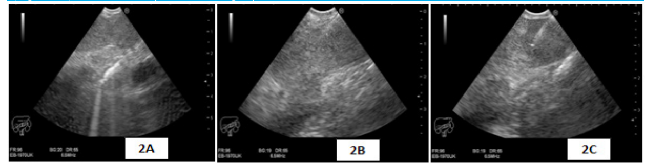
Figure 2. EBUS images form right paratracheal measuring 18 x 14 mm (Figure 2A) and subcarinal measuring 16 x 12 mm (Figure 2B) stations. EBUS guided TBNA pass being taken from the right paratracheal station (Figure 2C). Needle is visualized as hyperechoeic structure entering the node from cranial end.